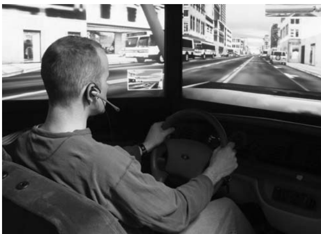
Figure 2. Participant talking on a cell phone in the I-Sim driving simulator.

To determine who initiated the reference to traffic, we analyzed the number of initializations made in the cell phone conversation