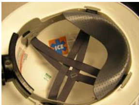
ICE Card Equipped Safety Helmet

This simple, yet effective safety concept is based on personal responsibility and preplanning – much like jobsite safety.