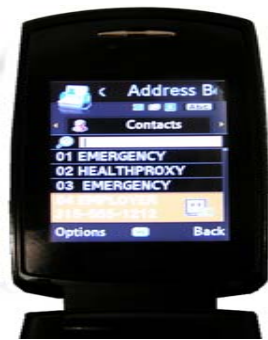
E.123 International ICE Standard

ICE was originally meant to act as a contact tool in cell phones but this widely recognized symbol has since taken on more safety roles!